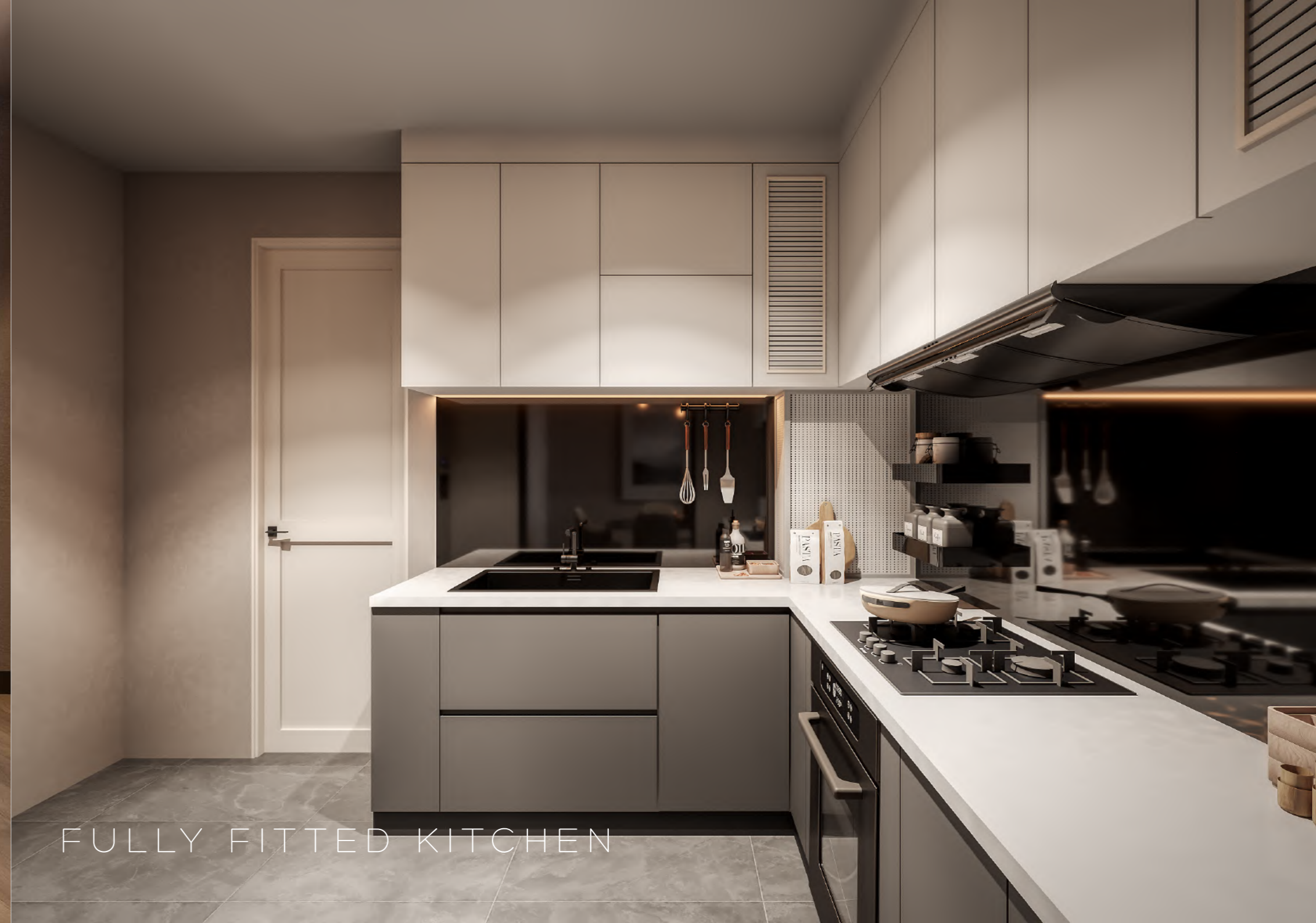
FULLY FITTED KITCHEN